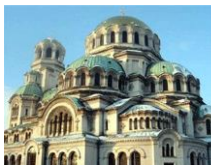
Alexander Nevsky Cathedral

The region classified as Thrace or the extreme south-eastern Balkans – where the eastern land boundaries of Greece and Bulgaria are situated – is one such geography. It lies further north than the Armenian one and is significantly less strategic and the least exposed. It is also restricted geographically by maritime barriers.