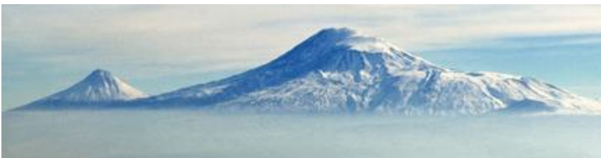
Mount Ararat: Zenith of the Plateau of Armenia

The land of Ararat is the most exposed of the regions in question. Armenia, a distinct mountainous Plateau with its zenith at Biblical Mount Ararat, is situated south of the Caucasus Mountains. The Armenian nation was formed upon it and has inhabited its land of origin for thousands of years. In the past, however, Armenian kingdoms have expanded well beyond their Plateau of origin – up to the Mediterranean and Caspian Seas. No nation inhabiting the Plateau predates the Armenians. States such as the Republic of Armenia and Nagorno-Karabakh, or to give the latter's correct original title, Artsakh, are formed upon its eastern sector. Bible's Sacred Highland .