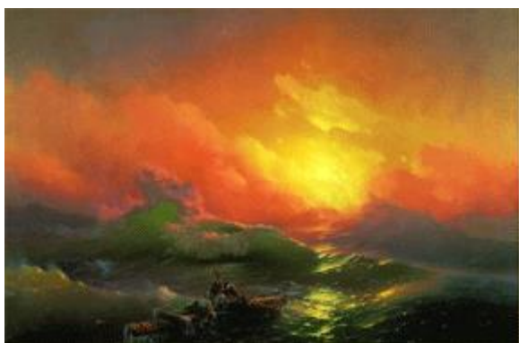
The European Sector of the Northern Caspian is the point from which commences a major latitudinal dividing line, extending eastwards to Vladivostok and a vital Pacific Ocean outlook. The illustration is Aivazovsky's Ninth Wave .