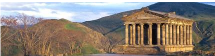
Armenian Temple 1st Century AD, Garni, Republic of Armenia

The land of Ararat is the most exposed of the regions in question. Armenia, a distinct mountainous Plateau with its zenith at Biblical Mount Ararat, is situated south of the Caucasus Mountains. The Armenian nation was formed upon it and has inhabited its land of origin for thousands of years. In the past, however, Armenian kingdoms have expanded well beyond their Plateau of origin – up to the Mediterranean and Caspian Seas. No nation inhabiting the Plateau predates the Armenians. States such as the Republic of Armenia and Nagorno-Karabakh, or to give the latter's correct original title, Artsakh, are formed upon its eastern sector. Bible's Sacred Highland .