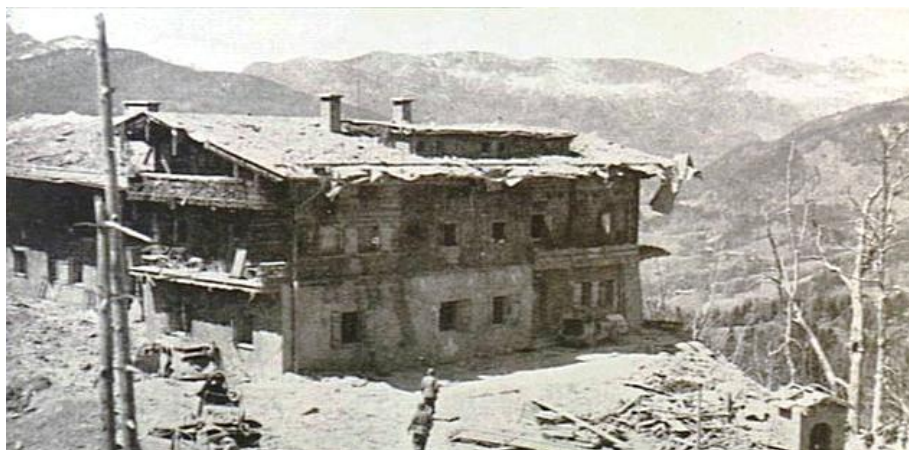
Obersalzberg, Bavaria: the Alpine complex of the Third Reich's hierarchy; it also housed a detachment of SS troops, for the security of the Führer . The highest building on the mountain peak was the prestigious Eagles Nest. The complex was destroyed on 25 th April 1945 by an aerial raid, planned by Allied Bomber Command.

Among the copious ideological goals of National Socialism was the resolute attempt to re-engineer a European race. This aim was possibly the most unrealistic. It is best to preserve what you already have. Fervent implementation of Nazi ideologies within Continental Europe had to a certain extent, caused misalignments to the stratified equilibrium of the European Civilisation. Frontiers of Europe . Consequently, a set of standards and values had to be reestablished and realigned, inclusive of subsequent enhancements with Global ramifications. Rights and Values . Racist-nationalist ideologies – internally or externally generated – as well as externally driven politicized expansionist religious movements undermining the European Civilisation within its Global Geography – as recorded above – can be extricated decisively. Initially, of course, it is imperative not to repeat the errors of the past.